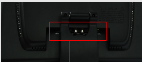
The rear panel of ADM-17A